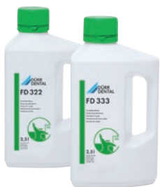
FD 322 or FD 333 Quick-acting disinfection