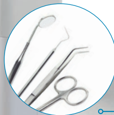
ID 212 or ID 213 Instrument disinfection