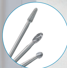
ID 220 Bur disinfection