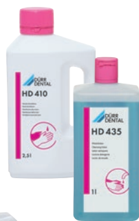
HD 410 Hand disinfection