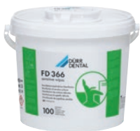
FD 366 sensitive wipes