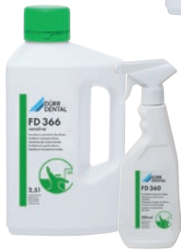
FD 366 sensitive Disinfection of sensitive surfaces